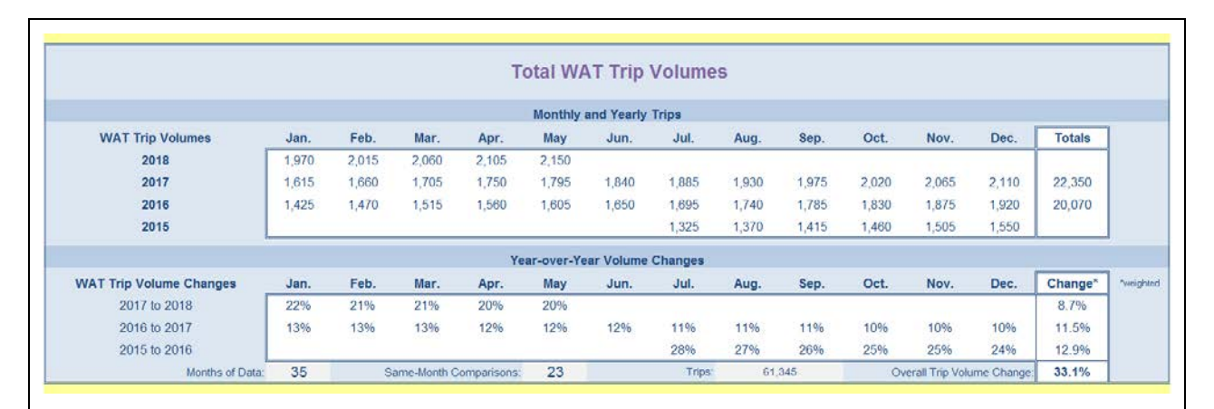
Figure 4: This "Total WAT Trip Volumes" table fills in automatically on sheet C5. In this example, data for 35 months is used to make 23 same-month comparisons—each monthly comparison with a weighting of 1/12— to calculate the overall, annualized change in trip volume (33.1% in this example).

calculations are made with 35 months of data that span two full calendar years and two other partial years.