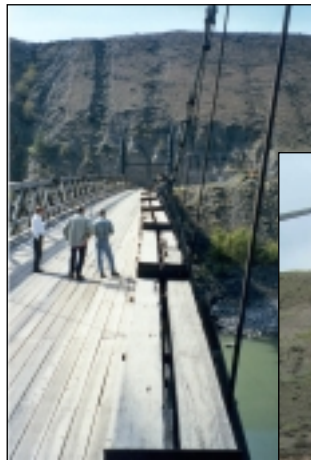
Churn Creek Bridge, before and after.