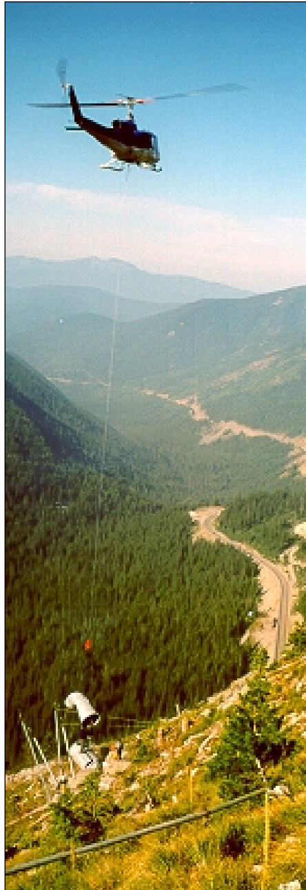
A helicopter lowers part of a Gaz.Ex system into place.

The efficiency of the GAZ.EX system is evident when you consider that it took at least one hour to do avalanche control on the eastside avalanche area (North Fork) with the 105mm recoilless rifle and now it takes less than 20 minutes to shoot 10 exploders accomplishing the same work. Highway closure times have been shortened with this type of equipment. In Europe, Japan, Chile, USA and Canada, GAZ.EX is a popular alternative to conventional avalanche control with explosives. With the latest technology in this final phase, the MoTH snow avalanche