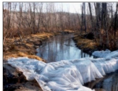
Terminus of groundwater channel showing the temporary dam.

Channel excavation and placement of large organic debris was carried out over five days in the latter part of October under the supervision of an Engineering Technician and Restoration Biologist from DFO. A temporary sandbag dam and a series of geotextile sediment control structures were installed at the terminus of the excavated channel to prevent sediment movement into Naver Creek. The work wrapped up with the application of seed, straw mulch and the planting of live stakes of red osier dogwood, willow and cottonwood. During 2001, the newly created channel will be kept isolated from the mainstem in order to allow time for a vegetative cover to establish and thereby minimize sediment transport into Naver Creek following dam removal. The channel is expected to be available next year for juvenile chinook looking for a refuge area where they can conserve energy and avoid being flushed downstream by high flows in Naver Creek.