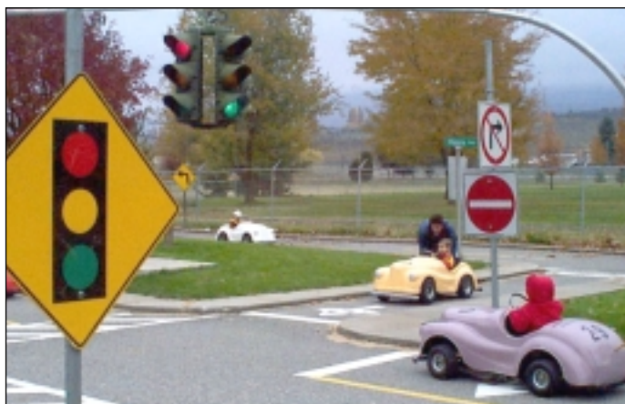
Bright new signs replace old in The Little Travellers Safety Village