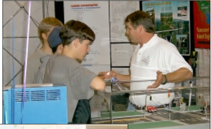
(Above) Students check out MoTH display at School District 68 career fair.

Both groups have done an outstanding job over the past decade in meeting both regional and Vancouver Island Highway project challenges. The Mount Washington Roadway and the Duke Point Highway are two projects worth mentioning. Collectively, team members have successfully completed nearly 200 Contract for Service assignments, while also dedicating a cumulative total of 28 person-years of work for the Vancouver Island Highway project. Achieving this level of excellence consistently over such a long period of time is a tribute to good teamwork and dedication to detail. Congratulations for a job well done!