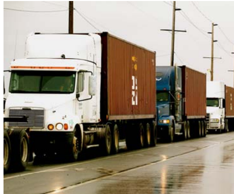
The South Fraser Perimeter Road will improve movement and reduce truck traffic in our communities.

Approximately 40km long, the South Fraser Perimeter Road will be a new four-lane, 80 km/h route along the south side of the Fraser River beginning at Deltaport Way in Southwest Delta to 176 Street in Surrey, with connections to Highway 1, and to TransLink's future Golden Ears Bridge, which is currently under construction.