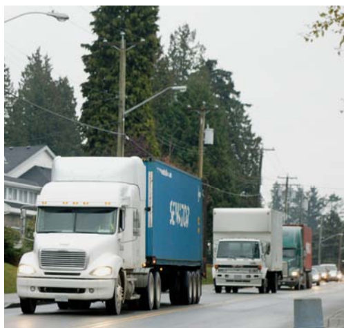
The South Fraser Perimeter Road provides a new route that will take industrial truck traffic off River Road.