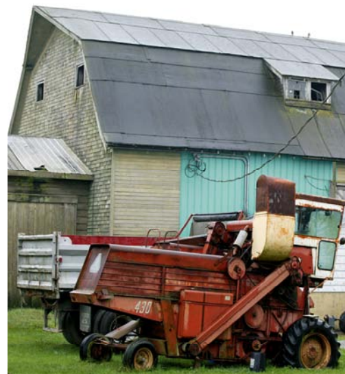
Colourful fields, hard working farmers and farm vehicles are evidence of the community's agricultural tradition.