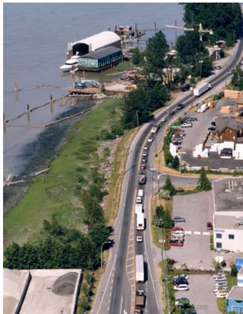
Large container trucks on community roads create noise and make safety an issue for local traffic and residents.

Major transportation infrastructure improvements are needed to address previous growth and build for future generations.